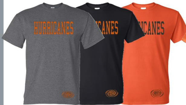
8000 Gildan Youth or Adult Short Sleeve T-Shirt Dark Heather * Black * Orange $15.00

We have made every attempt to create flyers free from errors. However, we do reserve the right to correct pricing errors. Color choices may also vary when printed on paper compared to actual fabric.