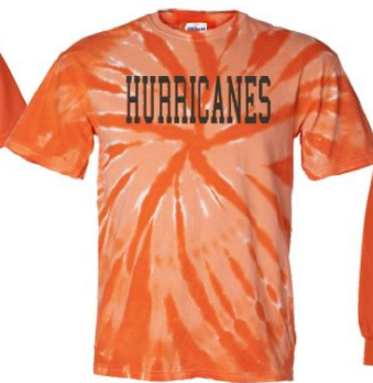
200NTT Dynemite Youth or Adult Neon Pinwheel Tye Dye Tee Neon Orange $15.00