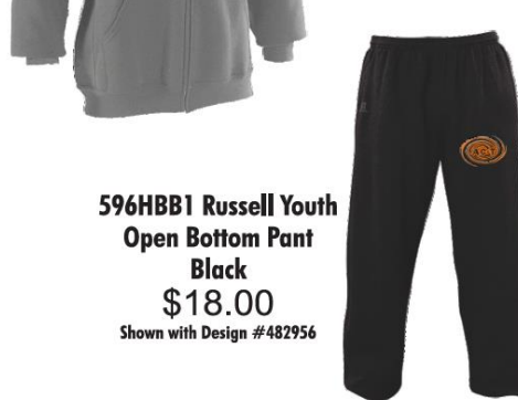
596HBB1 Russell Youth Open Bottom Pant Black $18.00