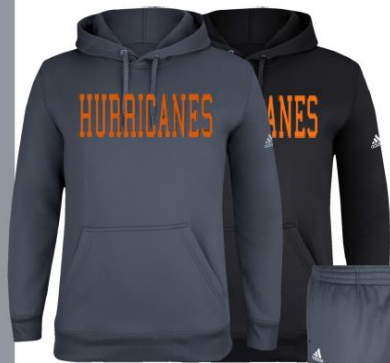
359F adidas® Clima Warm Tech Fleece Hood Onix * Black $43.00