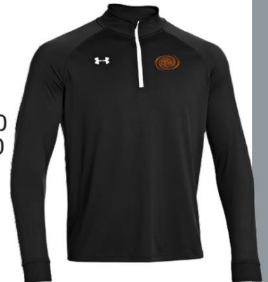
1246570 Under Armour® Every Team's Armour 1/4 Zip Black $33.00