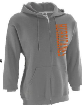
697HBM1 Russell Youth or Adult Full-Zip Hood Oxford Youth - $25.00 Adult - $28.00