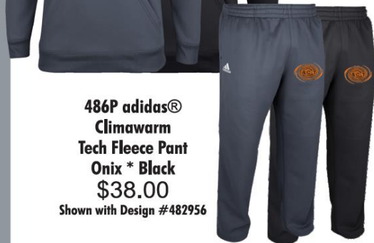
486P adidas® Climawarm Tech Fleece Pant Onix * Black $38.00