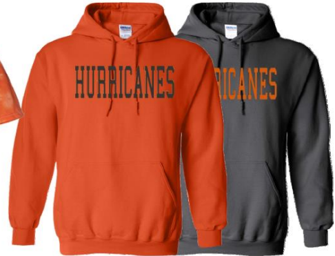
18500 Gildan Youth or Adult Hooded Sweatshirt Orange or Charcoal $20.00